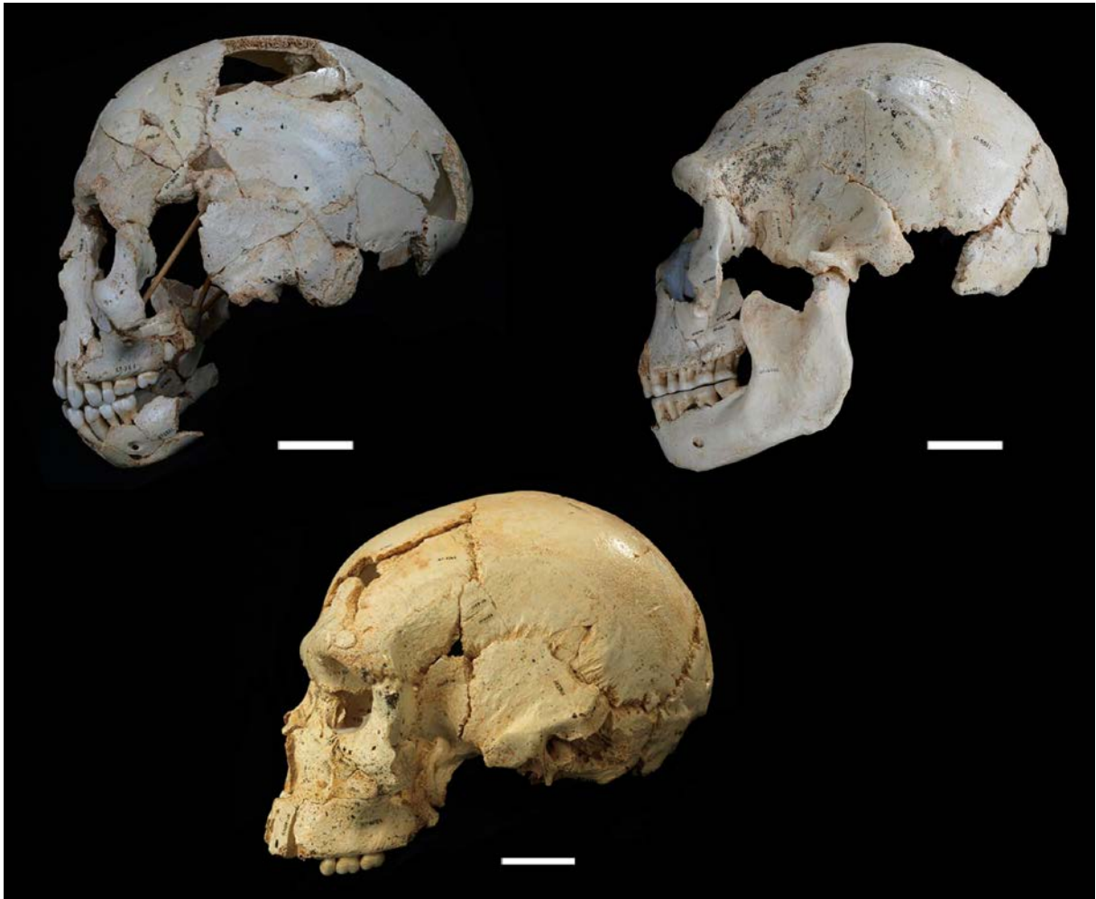
Fig. 1. Cranium 9 (top left), Cranium 15 (top right) and Cranium 17 (bottom) from SH. Scale bar = 3 cm.